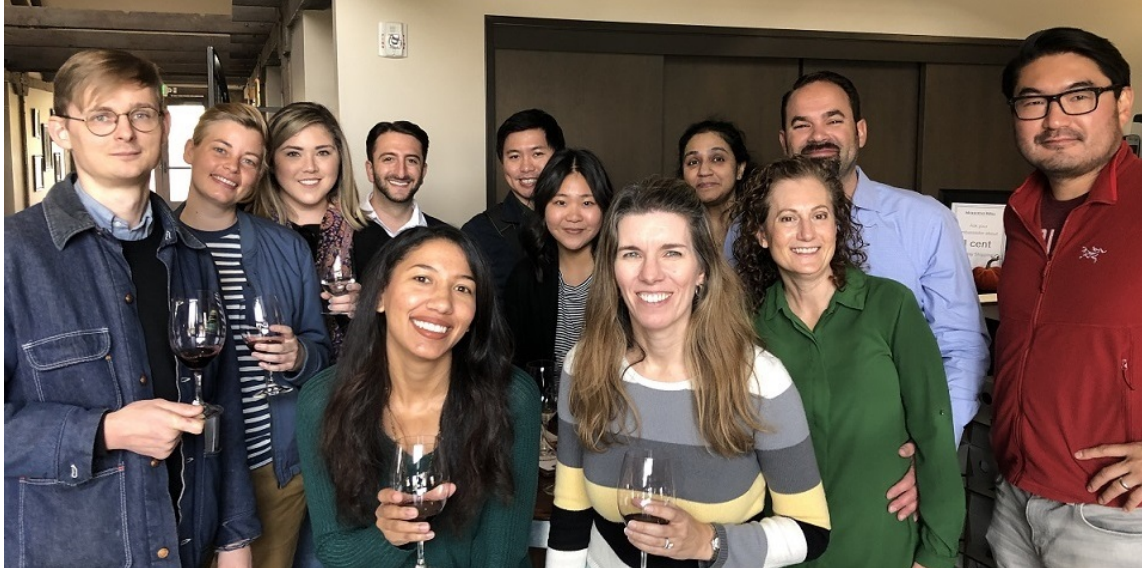
FVAP enjoying our 2018 holiday party together on November 16.