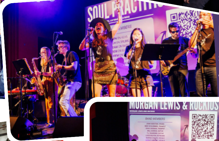
Left: Soul Practitioners (Cooley, Schaerr Jaffe, Latham Watkins)