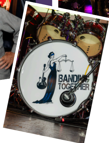
Left: Battle of the Bands, Banding Together to End Domestic Violence