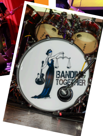
Left: Battle of the Bands, Banding Together to End Domestic Violence