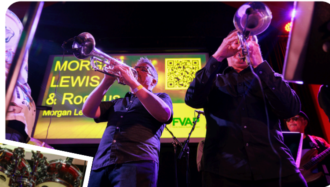
Above: Morgan Lewis & ROCKius (Morgan Lewis & Bockius)