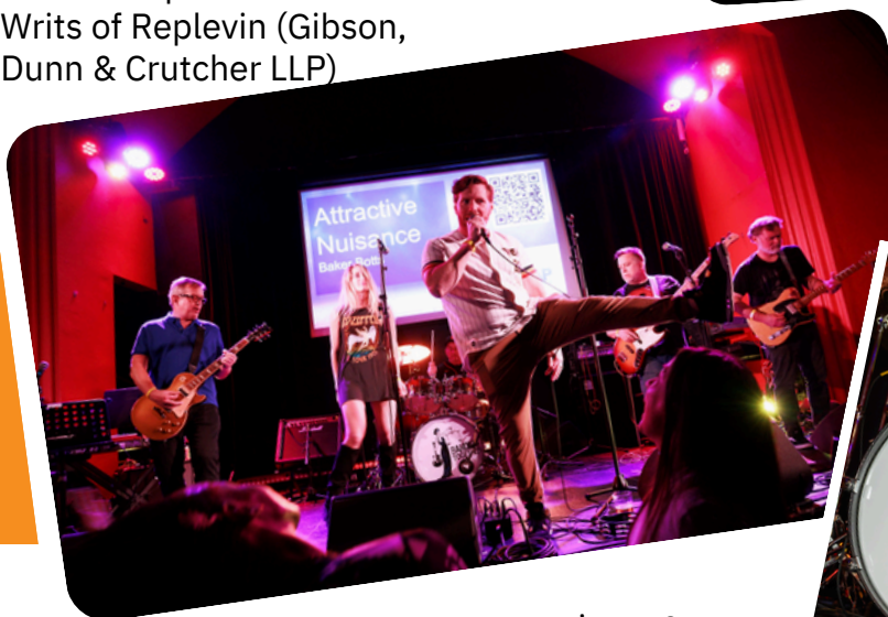
Above: Attractive Nuisance Baker Botts LLP (lawyers from Baker Botts, Greenberg Traurig, K&L Gates, Perkins Coie)