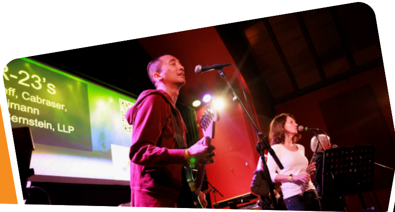
Left: R-23s (Lieff Cabraser Heimann & Bernstein, LLP) Below: COV'R Band (Covington Burling LLP)