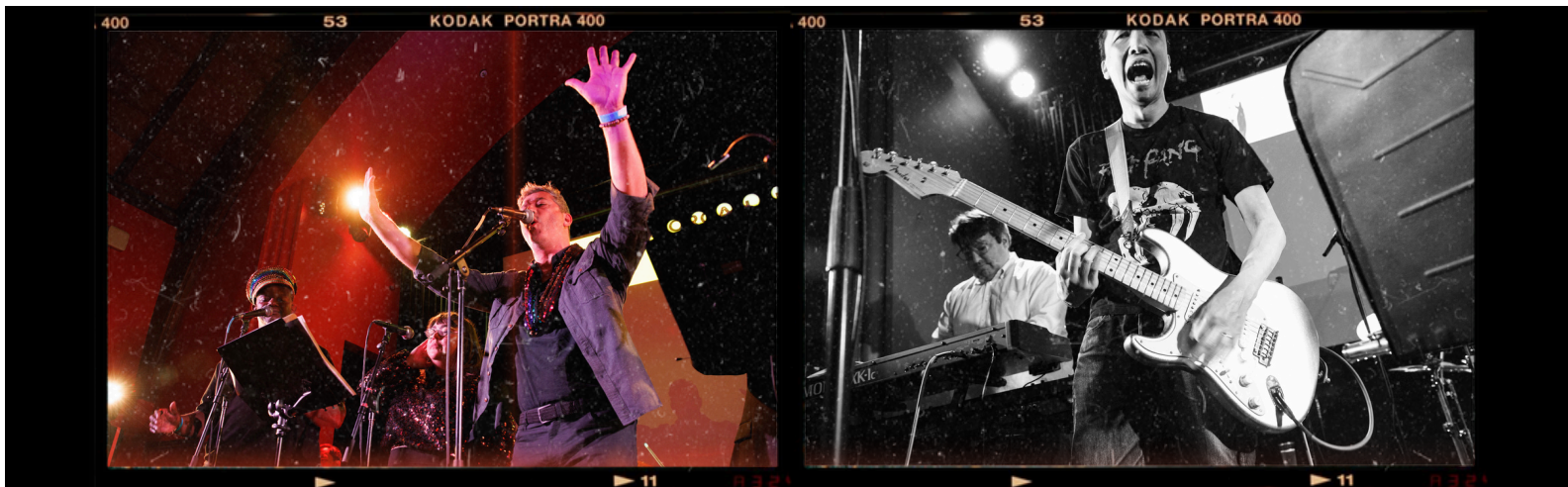
Morgan Lewis & ROCKius (Morgan Lewis & Bockius) | The R23s (Lief Cabraser Heimann & Bernstein)