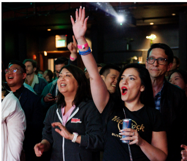
Fans cheering on their favorite band