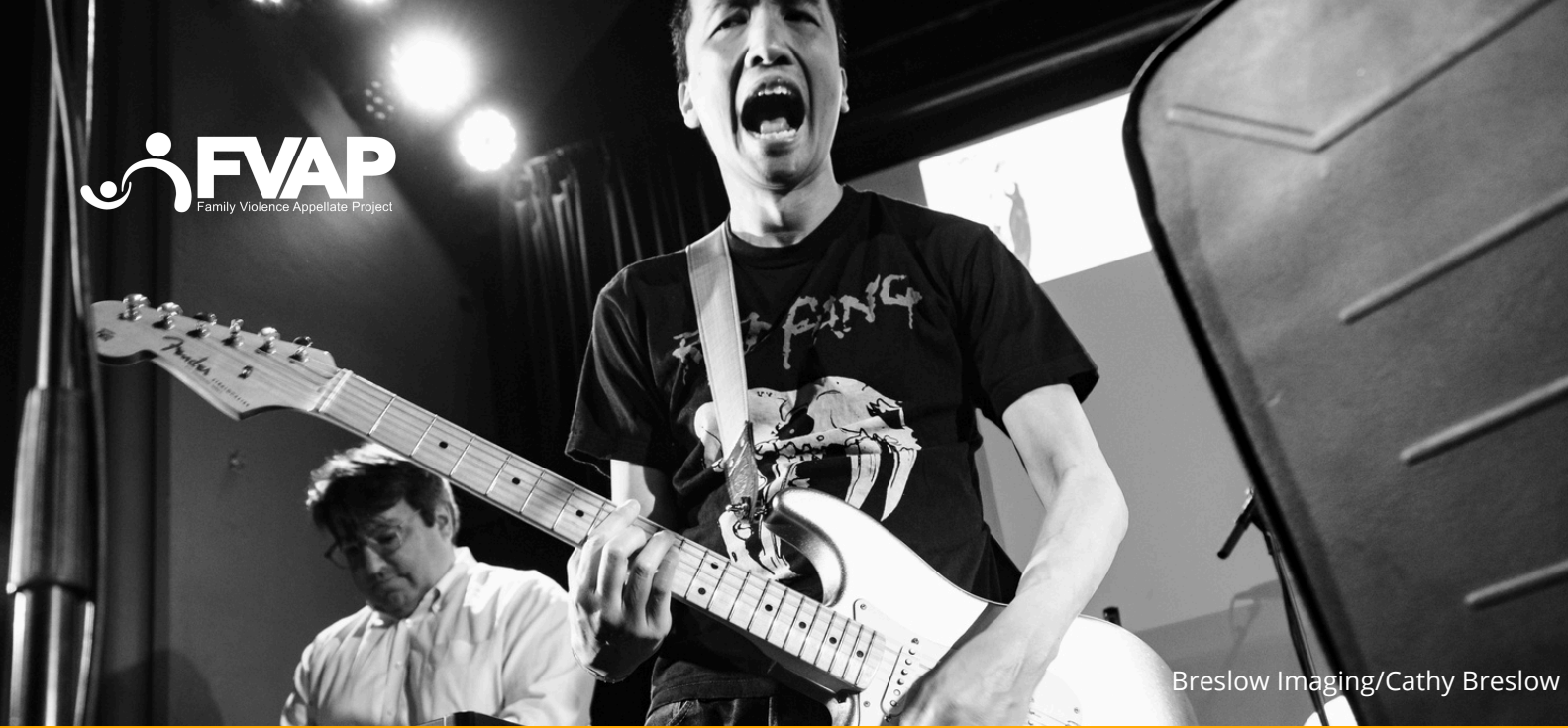
Breslow Imaging/Cathy Breslow